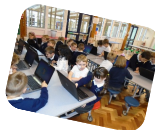
Using computers and the internet to learn about healthy eating