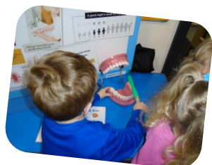
Learning about dental health in A-Life Workshops