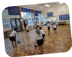
Children enjoying a fitness session with Premier Sport

We are extremely grateful to all these visitors who have or will enhance the children's learning with their interesting, enjoyable and often very entertaining presentations. There is a growing album of photographs and comments from the children linked to the Health & Safety weeks on the school website ( johnhampdenwendover.co.uk )—so do take a look.