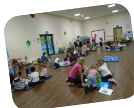
So many activities to complete linked to healthy lifestyles