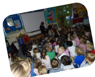
Listening to talks about the WOW Fitness initiative