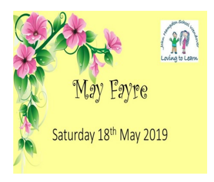
May Fayre, Saturday 18th May 12-3pm