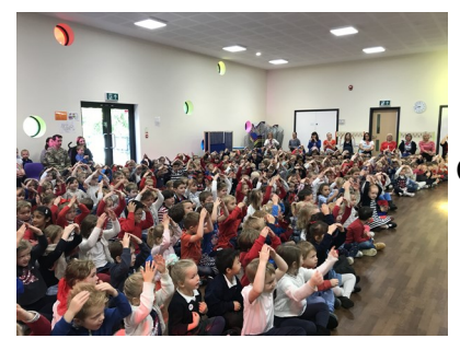
Children dressed in red, white and blue