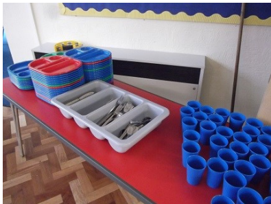
Independently accessing the plates, cups and cutlery. The coloured band indicates what meal has been ordered.

The children are gradually getting used to queuing for their lunch, independently collecting their plate, cup and cutlery. They are sitting together and sharing this time for social interaction and we have been impressed with their table manners and their ability to use the cutlery correctly! At the end of the meal they are responsible for scraping away any waste, stacking their plates and sorting their dirty cutlery. We are pleased to see their independence shining through and even our youngest children are coping very well with all that is being asked of them. As the weeks go by we hope the lunchtime system will become slightly slicker—we are constantly tweaking things- but it has been a good start and the children generally seem to be enjoying the food on offer. Pizza slices and fishfingers have proved to be the most popular so far!