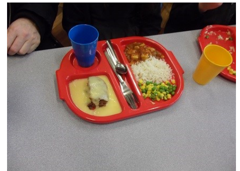
A selection of the food that is available. There is a meat, vegetarian or jacket potato option each day. There is always additional fruit and bread on offer.