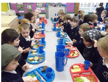
Enjoying their hot meal with their peers.