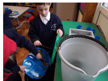
Clearing away independently after their meal.