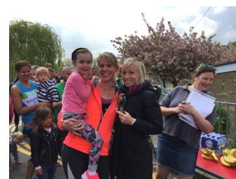
The winners of the adult 5km and 10km races