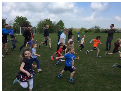
Starting and finishing the children's races. Great effort by all!